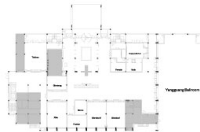
2F Meeting Rooms Floor Plan