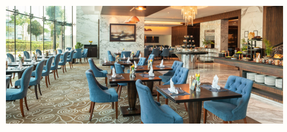
Outlet Name Author's Lounge Coffee Box The Cavendish The Leisure Deck