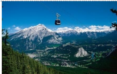
Gondolas in Banff National Park

Stephen Avenue Walk - (aka 8th Avenue) is Calgary's original entertainment and commercial district