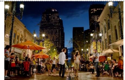
Stephen Avenue Walk