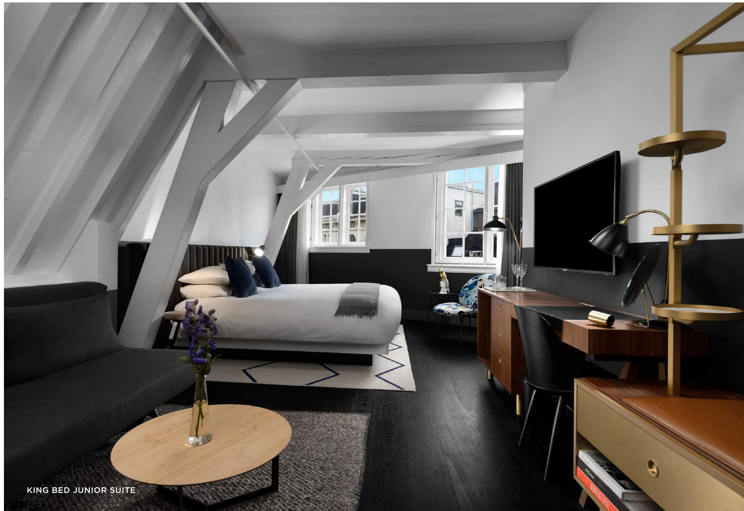
KING BED JUNIOR SUITE

THE SPACIOUS 31-56 SQUARE METER KING BED JUNIOR SUITES ARE PERFECT FOR THOSE WHO PREFER A LITTLE EXTRA ROOM. UNLOCK THIS REFINED URBAN OASIS WITH SMART, IMMERSIVE DESIGN. TASTEFUL FURNISHINGS AND A SOFT KING BED MEET EXPANSIVE WINDOWS WITH STELLAR AMSTERDAM VIEWS.