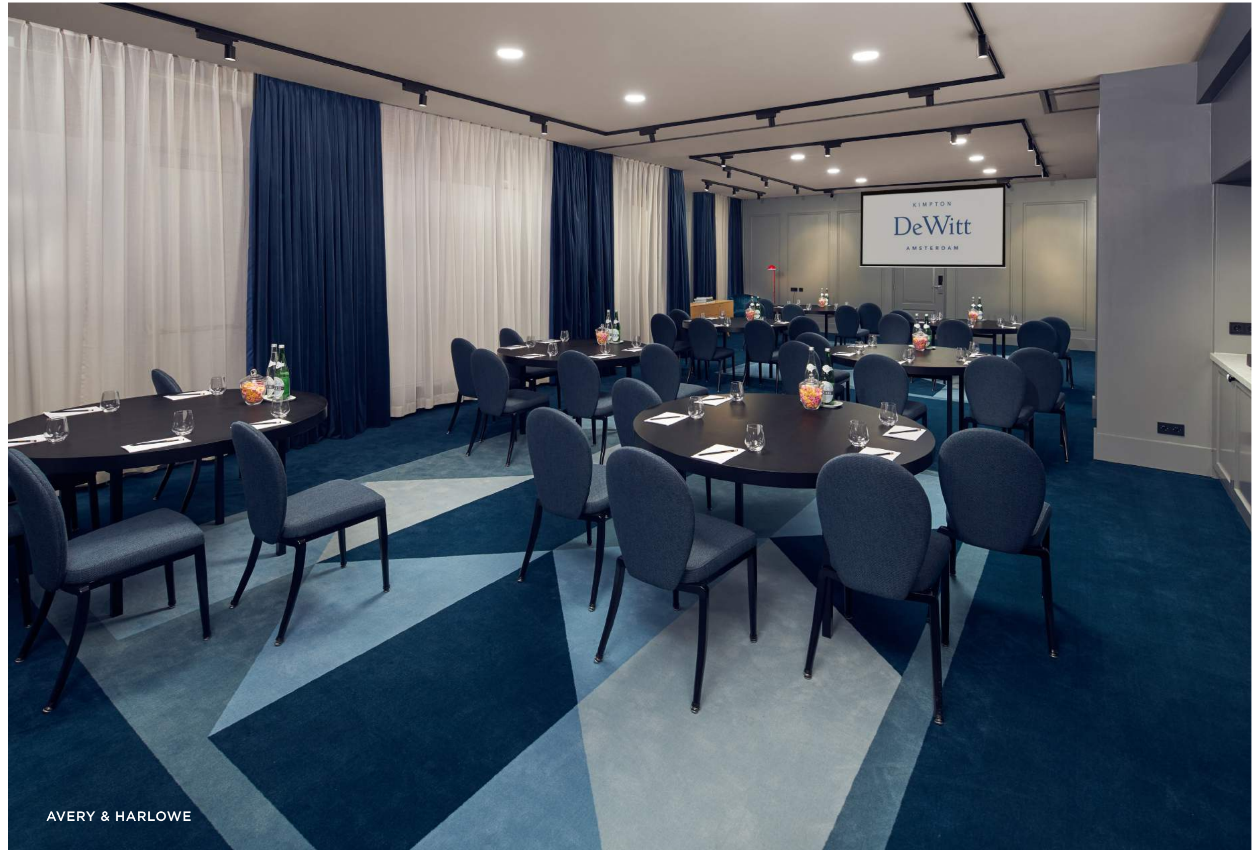
AVERY & HARLOWE

MULTIPLE SETUPS ARE POSSIBLE IN THE ROOMS: THEATER, RECEPTION, U-SHAPE, CLASSROOM, BANQUET, CONFERENCE AND SQUARE.