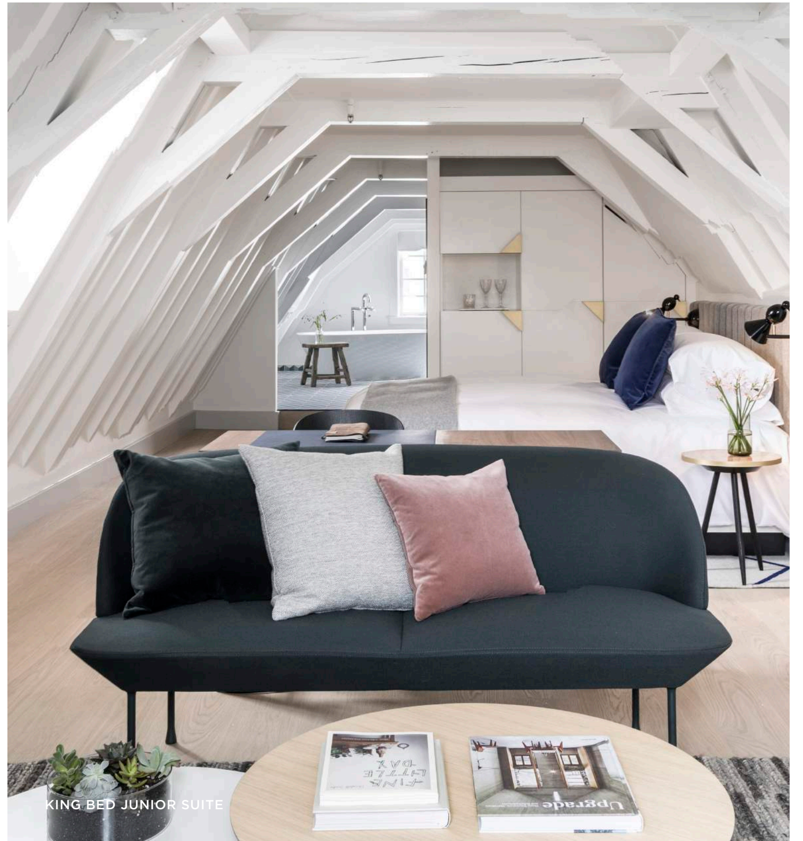
KING BED JUNIOR SUITE