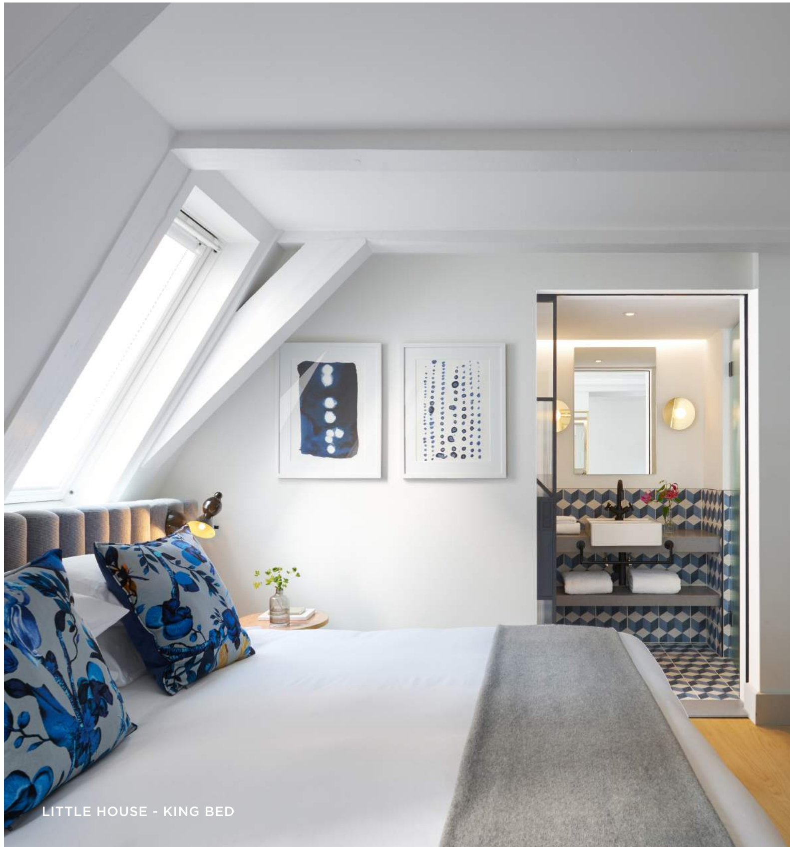
LITTLE HOUSE - KING BED