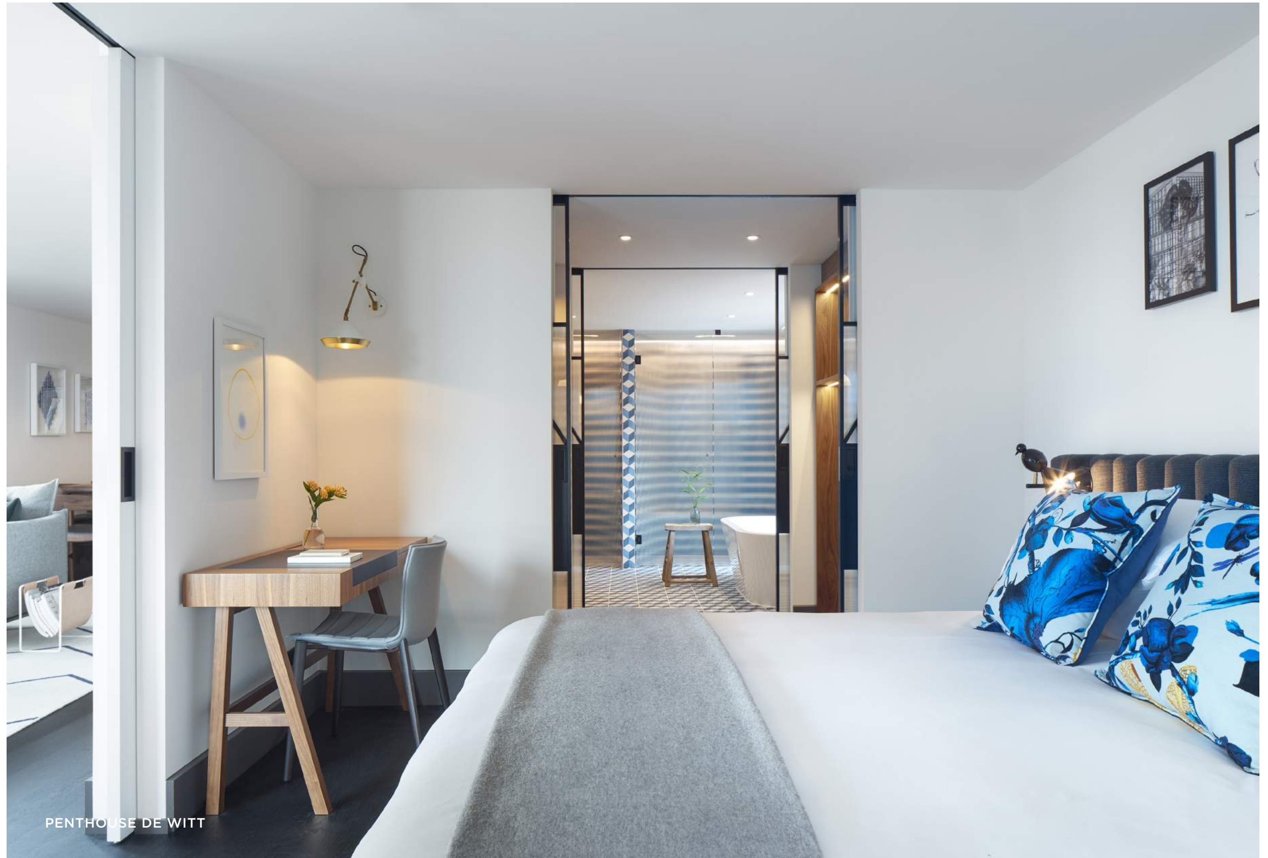
PENTHOUSE DE WITT

FOR THOSE WHO PREFER A LITTLE EXTRA ROOM, THE PENTHOUSE DE WITT IS THE PERFECT FIT.