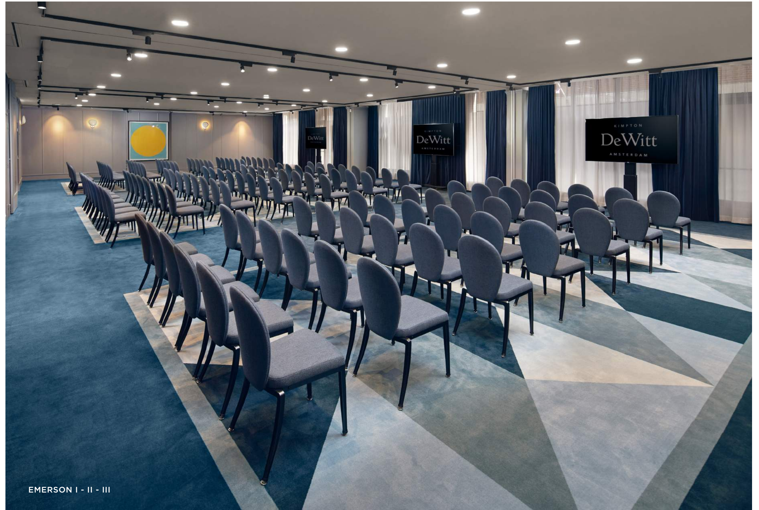
EMERSON I - II - III

MULTIPLE SETUPS ARE POSSIBLE: THEATER, RECEPTION, U-SHAPE, CLASSROOM, BANQUET, CONFERENCE AND SQUARE.