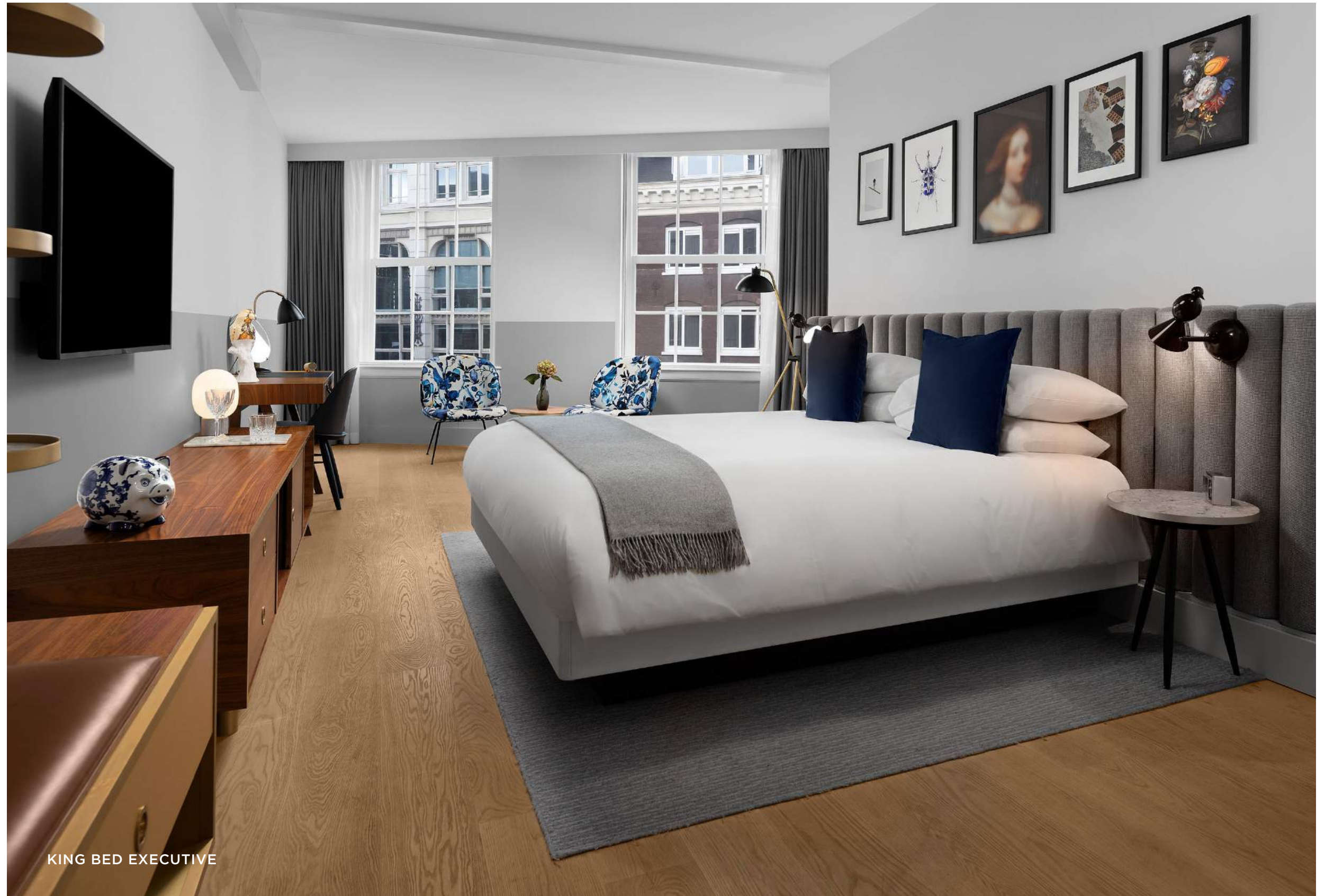
KING BED EXECUTIVE

WITH A FLAIR OF MINIMALIST DRAMA, LAYERED ARTISAN DETAIL AND SOPHISTICATED DESIGN, WE HAVE CARRIED THE CURATED WARMTH OF OUR PUBLIC SPACES INSIDE OUR 274 GUEST ROOMS. THE GUEST ROOMS SUBTLY NOD TO TRADITIONAL DELFT TILES, WEAVING A HANDCRAFTED MELD OF VIBRANT BLUES AND EMERALD GREENS, TEXTURED RUGS AND INSPIRED CUSTOM PIECES.