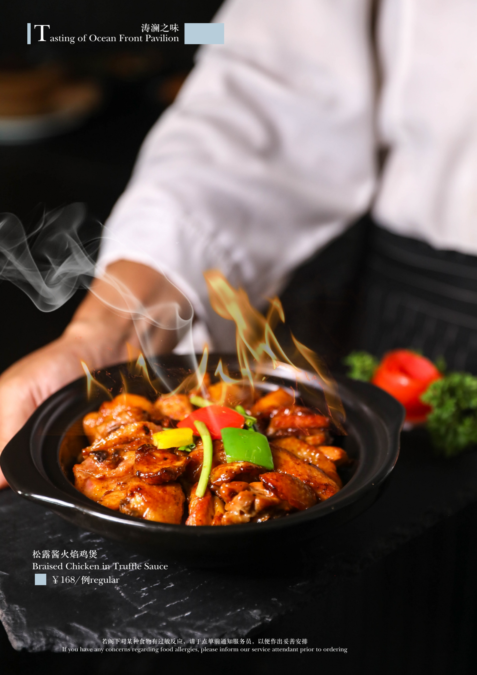
松露酱火焰鸡煲 Braised Chicken in Truffle Sauce ¥168/例regular

若阁下对某种食物有过敏反应，请于点单前通知服务员，以便作出妥善安排 If you have any concerns regarding food allergies, please inform our service attendant prior to ordering