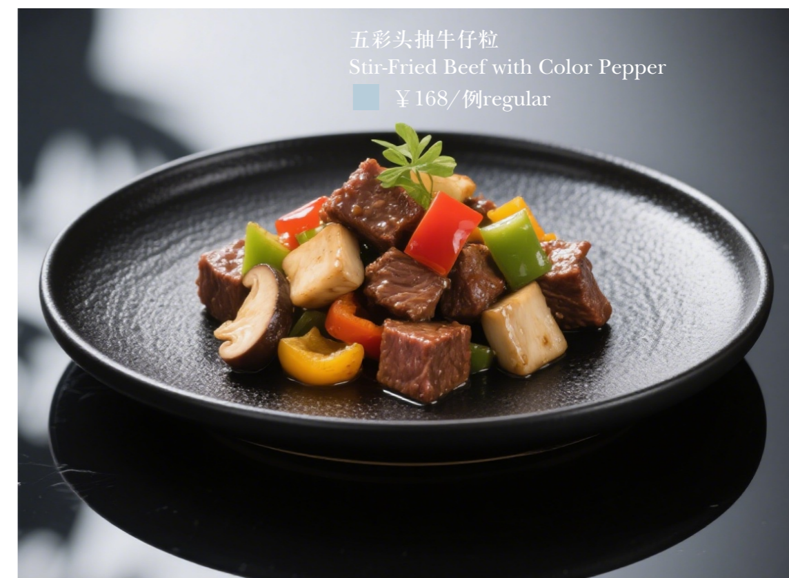
五彩头抽牛仔粒 Stir-Fried Beef with Color Pepper ¥168/例regular

若阁下对某种食物有过敏反应，请于点单前通知服务员，以便作出妥善安排 If you have any concerns regarding food allergies, please inform our service attendant prior to ordering