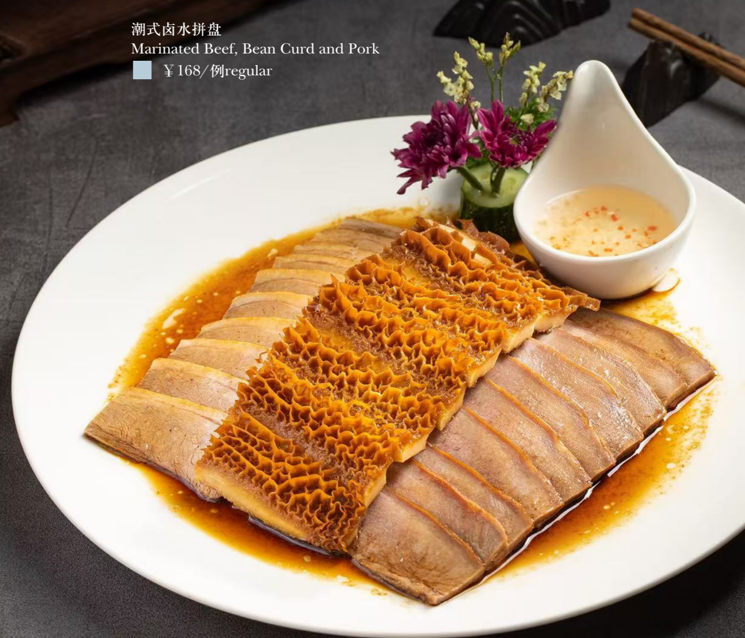
潮式卤水拼盘 Marinated Beef, Bean Curd and Pork ¥168/例regular

若阁下对某种食物有过敏反应，请于点单前通知服务员，以便作出妥善安排 If you have any concerns regarding food allergies, please inform our service attendant prior to ordering