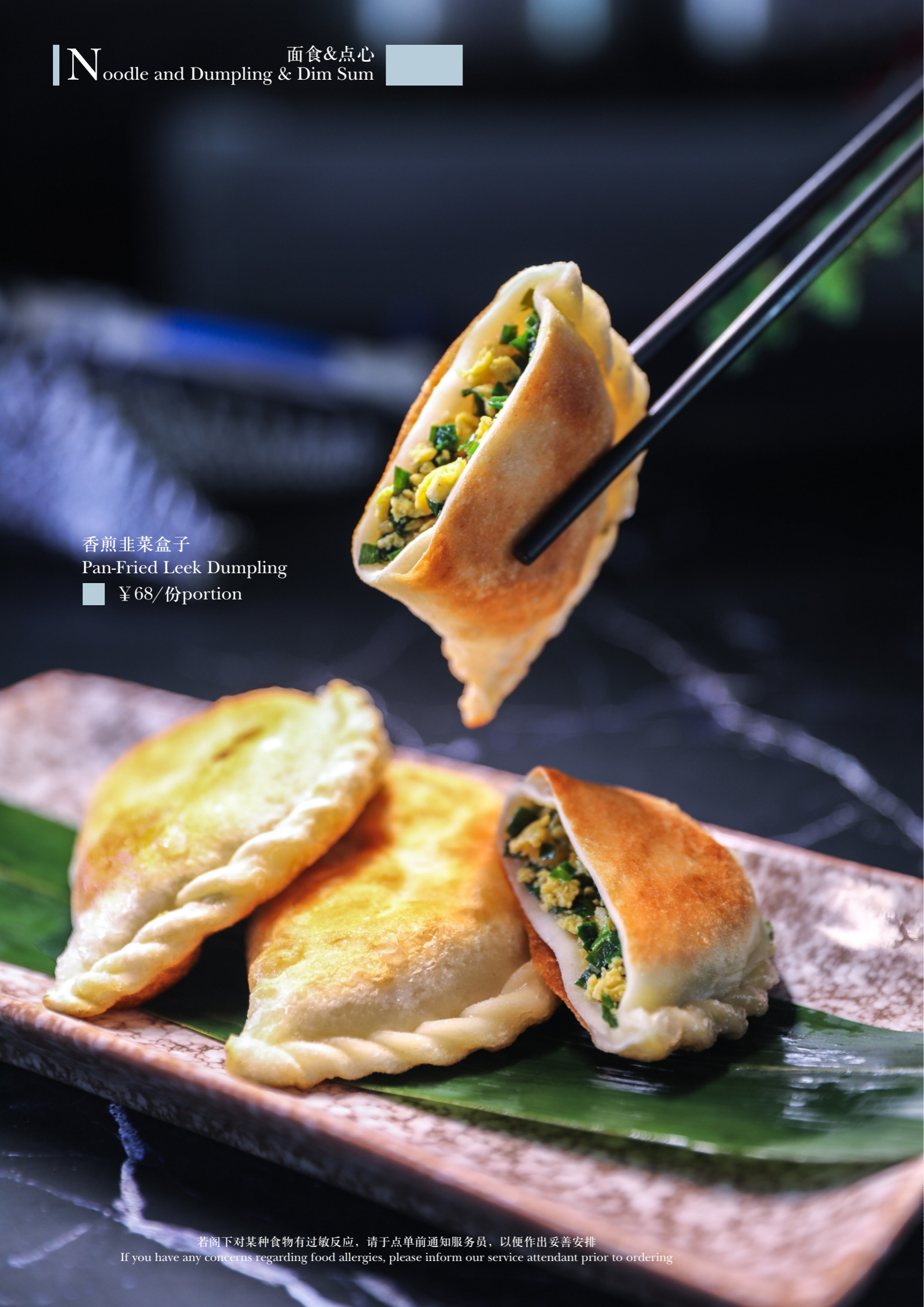
香煎韭菜盒子 Pan-Fried Leek Dumpling ¥68/份portion