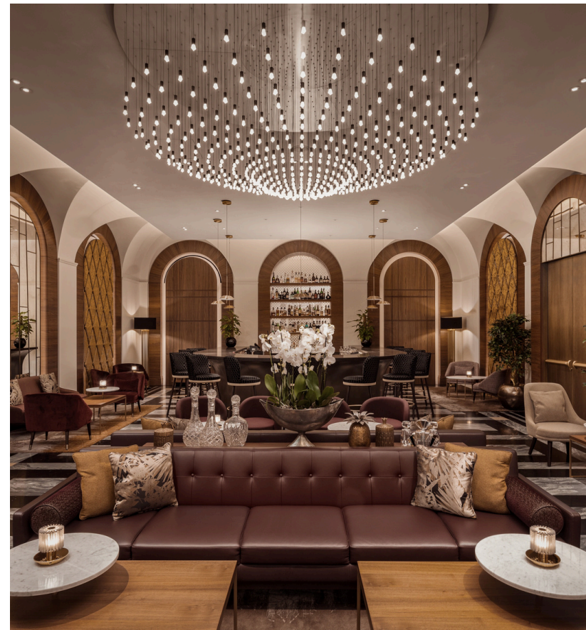
ANITA LOUNGE & BAR