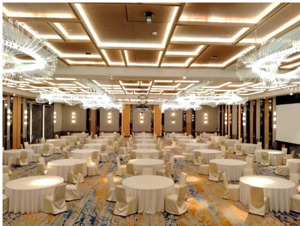
Banquet – Rounds of 5