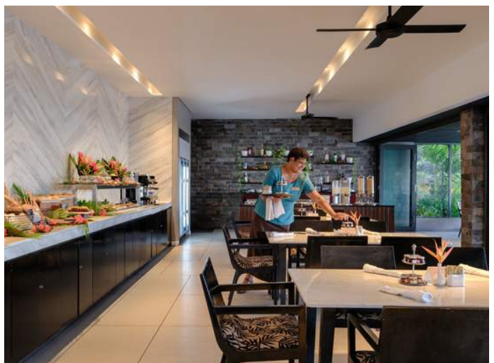
YOURS AND YOURS ONLY

Perched on a plateau above the main resort, the one-bedroom and two-bedroom Club InterContinental suites are scattered among lush gardens to heighten the sense of seclusion.