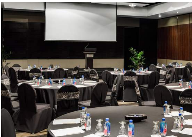
WATER COURT 3