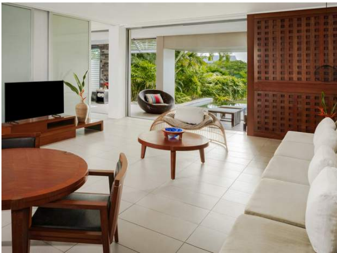
ASSIGN CLUB SUITES AS YOU LIKE

Club InterContinental welcomes guests of all ages. Exclusive buyout packages are available from 11 January – 31 March and 1 November – 20 December every year. Talk to us about your group's requirements and preferences – an exclusive buyout could be the perfect solution for you.