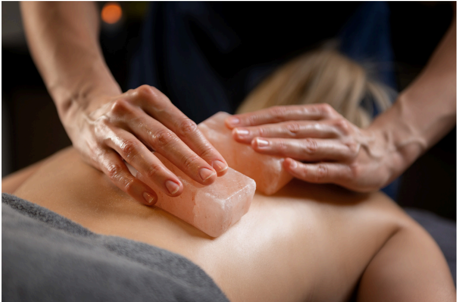
Himalayan Salt and Oil Massage Ritual

An exclusive revitalizing treatment for the body combined with a specific massage modality, which enhances its efficacy and pleasure. Thanks to the extraordinary composition of the Himalayan salt, rich in essential minerals, the treatment carries out an intense purifying and cleansing action. A warm salt stone massage is followed by a salt and oil scrub and application of body cream.