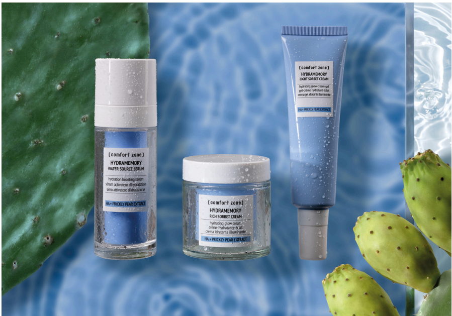
Hydra Memory Facial

A dynamic fresh treatment made for anyone seeking visible immediate glow, hydration and vitality. Thanks to its unique combination of Lactic Acid for immediate renewal and glow, the powerful concentration of Hyaluronic Acid for superficial and profound hydration, and the bioactive Prickly Pear extract from Regenerative Agriculture, we deliver instant hydration and radiance for a healthy dewy look.