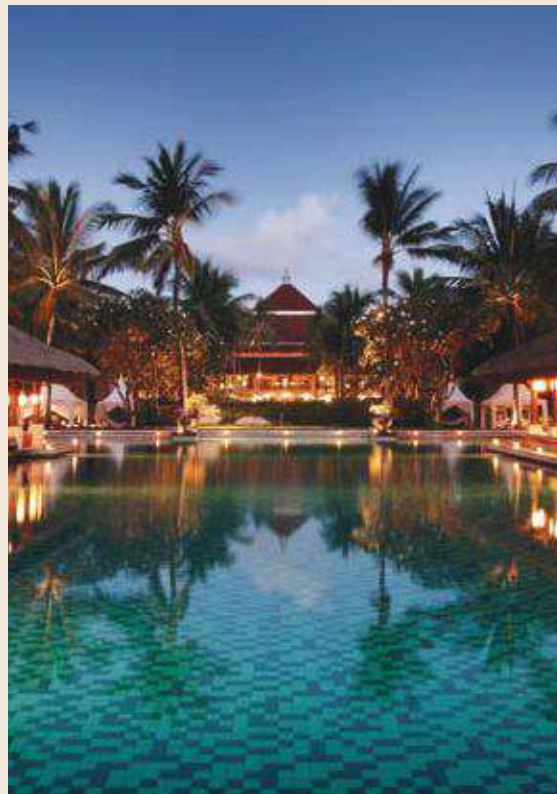
InterContinental Bali Resort

With the Resort celebration over, it's now time to enjoy your well-deserved honeymoon.