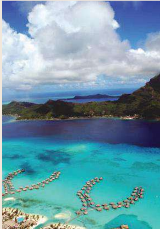
InterContinental Bora Bora Resort & Thalasso Spa