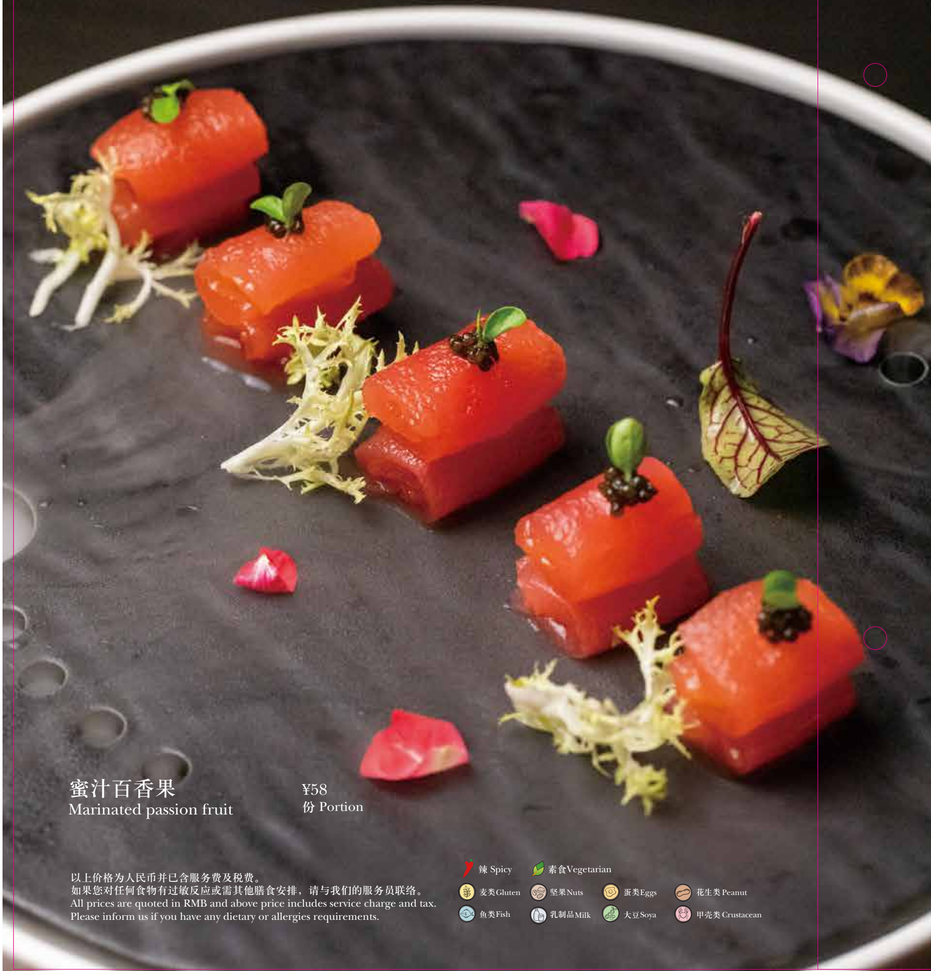
蜜汁百香果 Marinated passion fruit