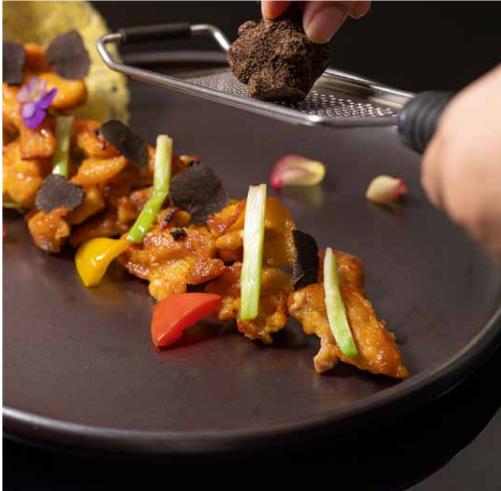
黑松露煎焗走地鸡 Braised chicken with truffle in clay pot