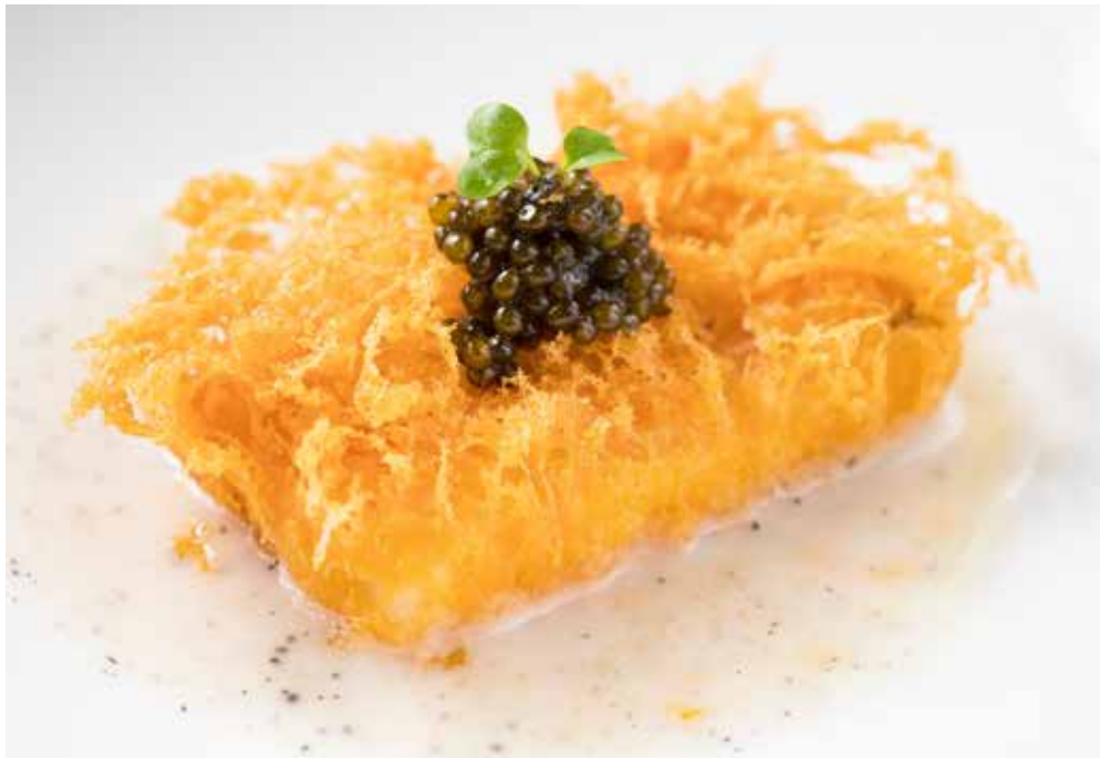
鱼籽酱蜂巢鹅肝 Deep-fried goose liver with caviar