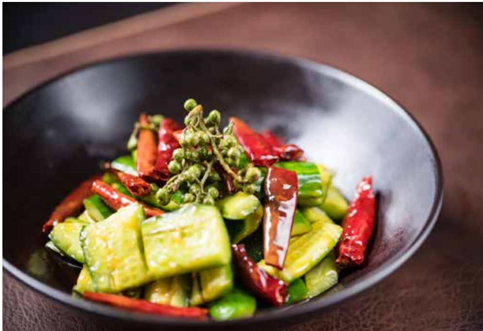
辣汁拍黄瓜 Marinated cucumber with spicy sauce