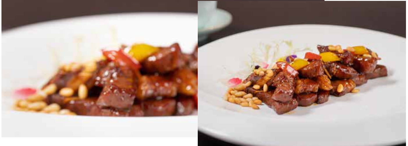
金沙脆皮豆腐 Deep-fried crispy bean curd