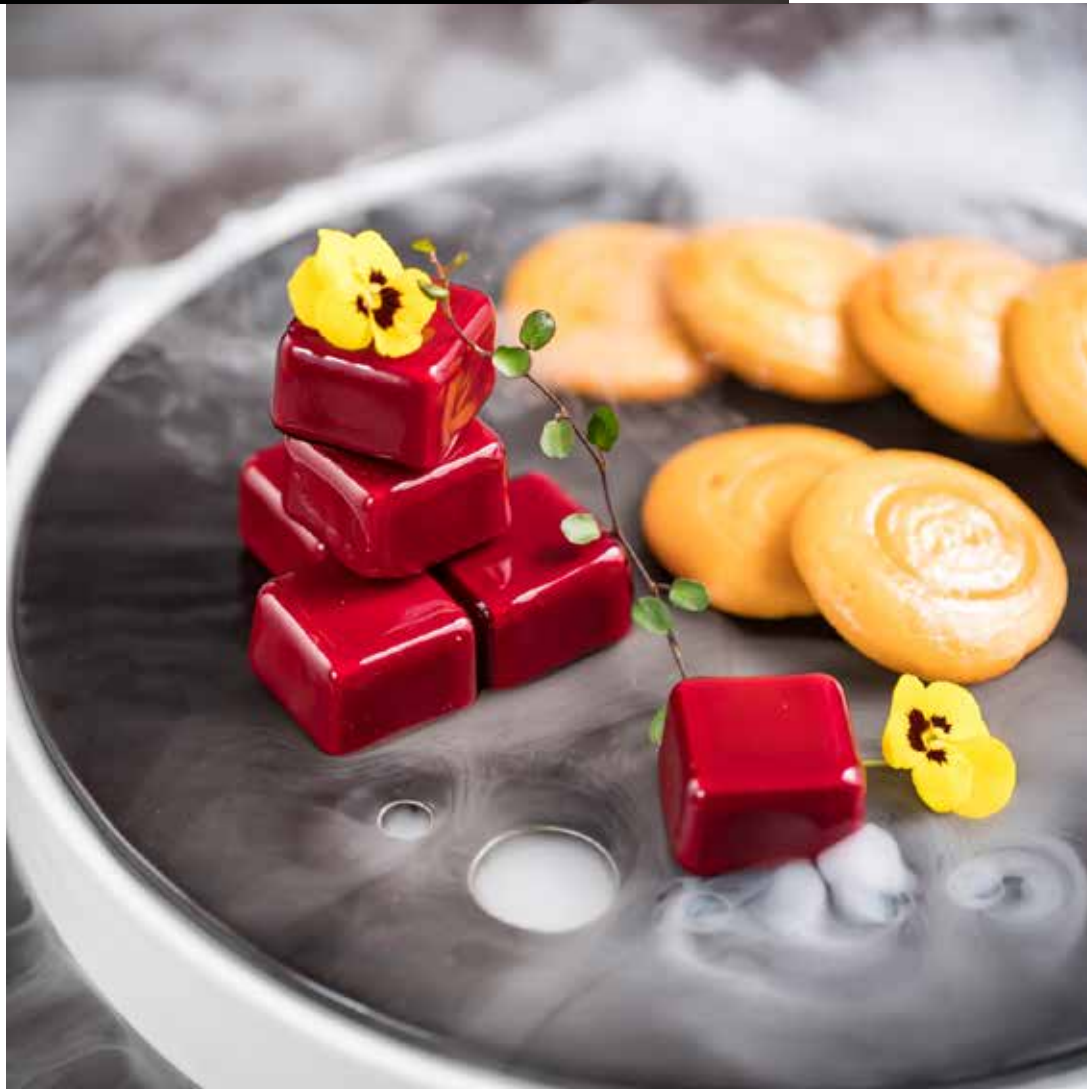
蓝莓酱冻鹅肝 (配葱油饼) Chilled foie gras in blueberry sauce (Served with spring onion cake)