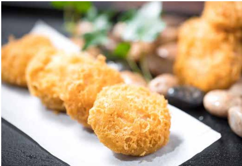
家乡荔芋莲藕饼 Pan-fried loquats root and taro with minced meat