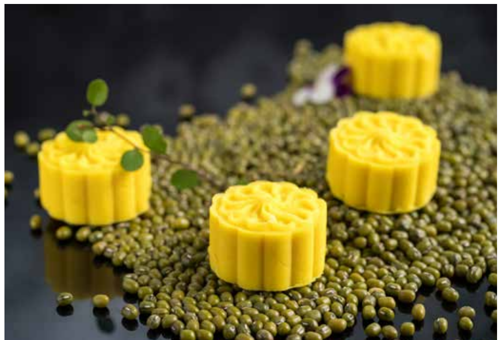
手工绿豆糕 (四件起售) (minimum 4 pcs) Freezing green bean cake with bird's nest