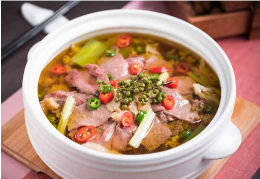
椒麻煮牛三样 Braised beef tripe, beef tongue with Sichuan pepper