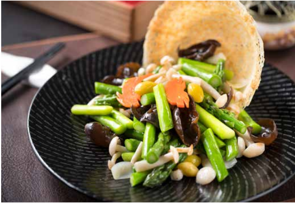
黑木耳银杏炒芦笋 Stir-fried wild mushroom and gingko nuts with asparagus