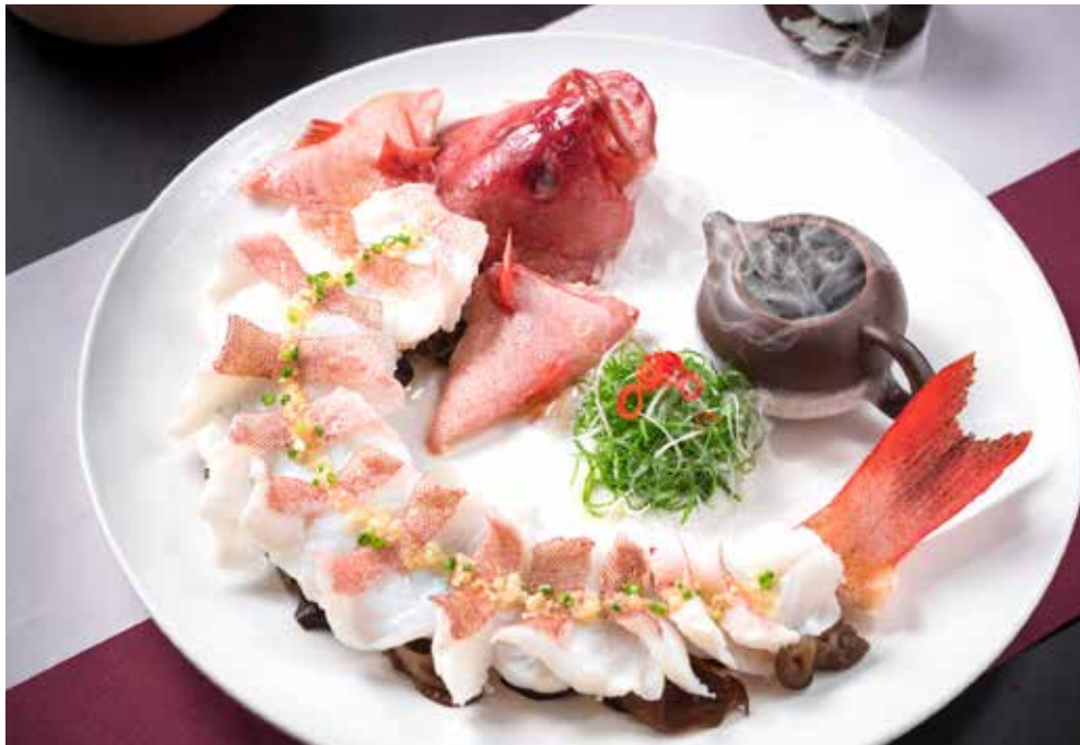
Star grouper (Steamed/sautéed fish meat with vegetable Sichuan pepper steamed/poached in s eafood broth/Shunde chili steamed) 红东星斑 清蒸 / 龙吐珠 / 浓虾汤过桥 鲜花椒蒸 / 顺德辣椒饼蒸 ¥888/500g