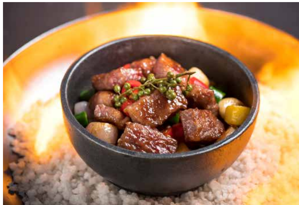
小炒湘西腊肉 Fried preserved meat with pepper