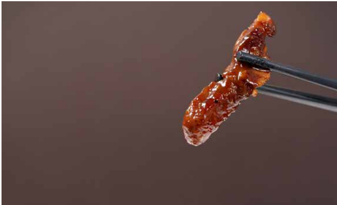
松果烧汁牛肋条 Str-fried beef with pine nut