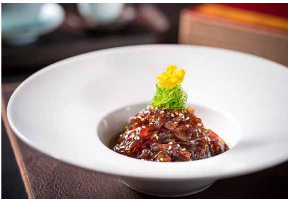
爽口海蜇头 Marinated jelly fish with vinegar and chili sauce