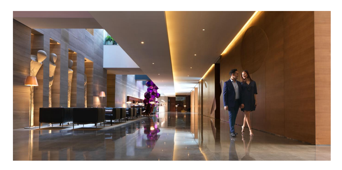
ART AT INTERCONTINENTAL DUBAI MARINA