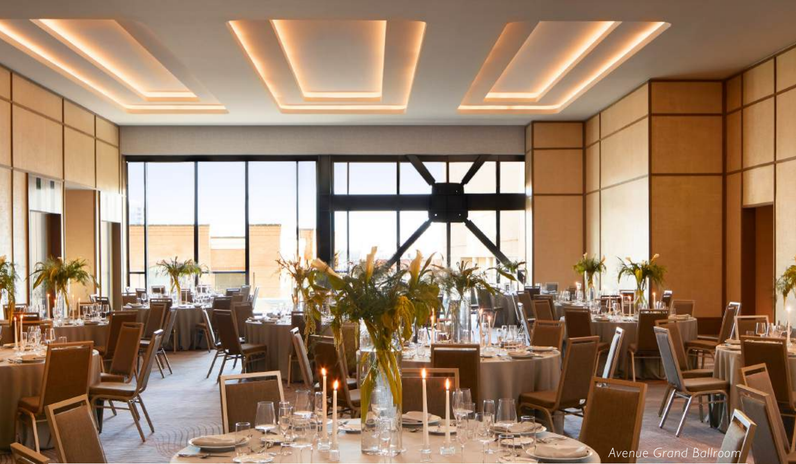
Avenue Grand Ballroom