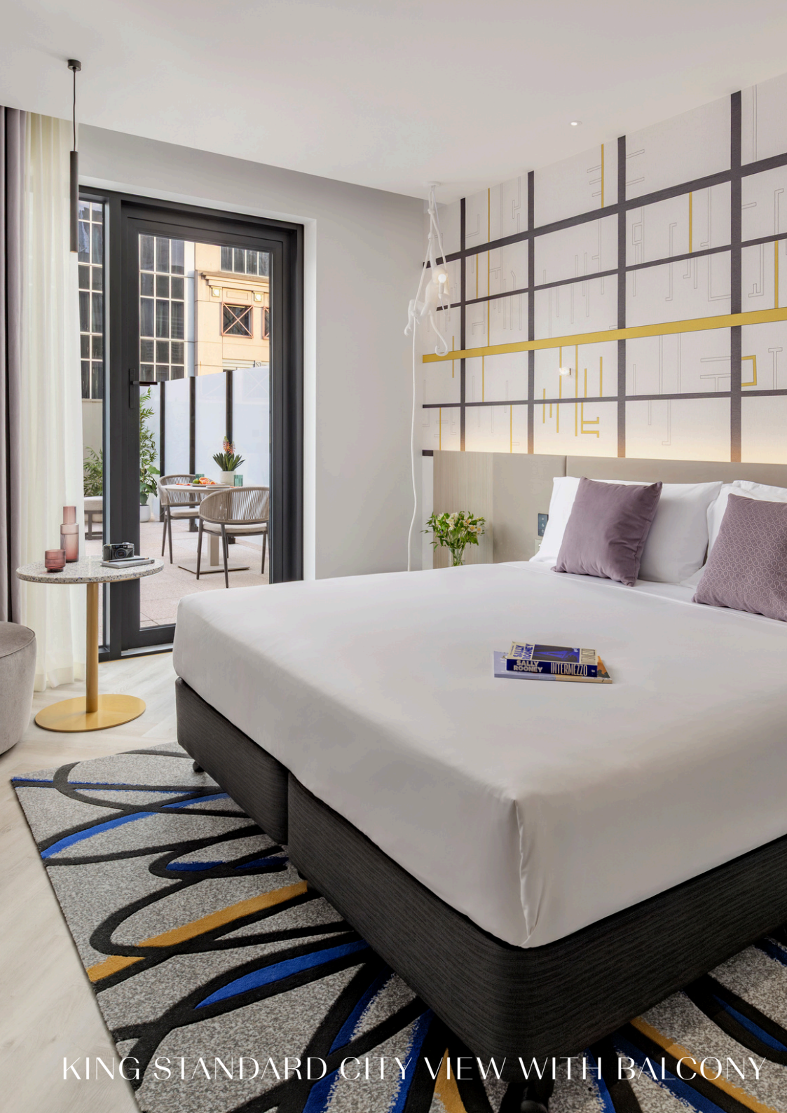
KING STANDARD CITY VIEW WITH BALCONY