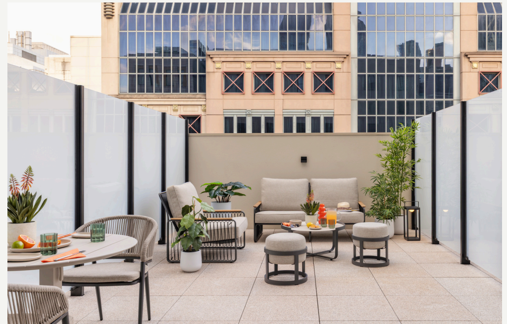
KING STANDARD CITY VIEW WITH BALCONY