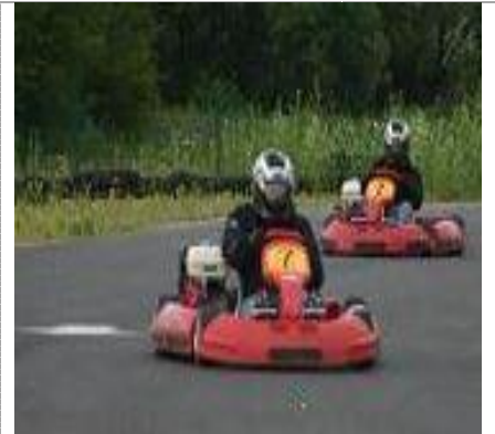
Go Kart Fun at Sudbury Kartways