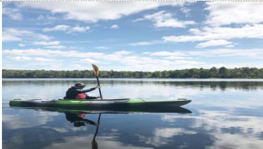
Beautiful Kivi Park on Long Lake

Start the day off with some fun at Sudbury Kartways – featuring Go Karts, Mini Putt, Batting Cages - located just 10 minutes from the hotel. Next, take the family down to Kivi Park, a huge multi-use sports and outdoor park overlooking beautiful Long Lake. The park offers countless activities – from hiking to canoeing and kayaking, picnic areas, and much more. Finish the day with a stroll on the Bell Park boardwalk and take in the beautiful views of Lake Ramsay and Science North.