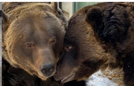
Forestry Farm Park & Zoo