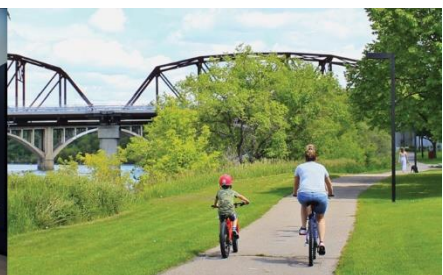
Meewasin Valley Authority