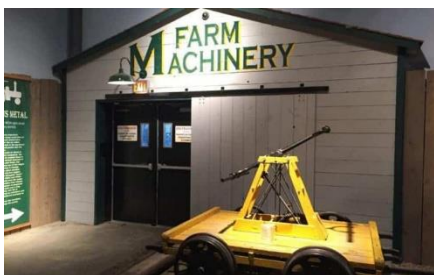
Western Development Museum