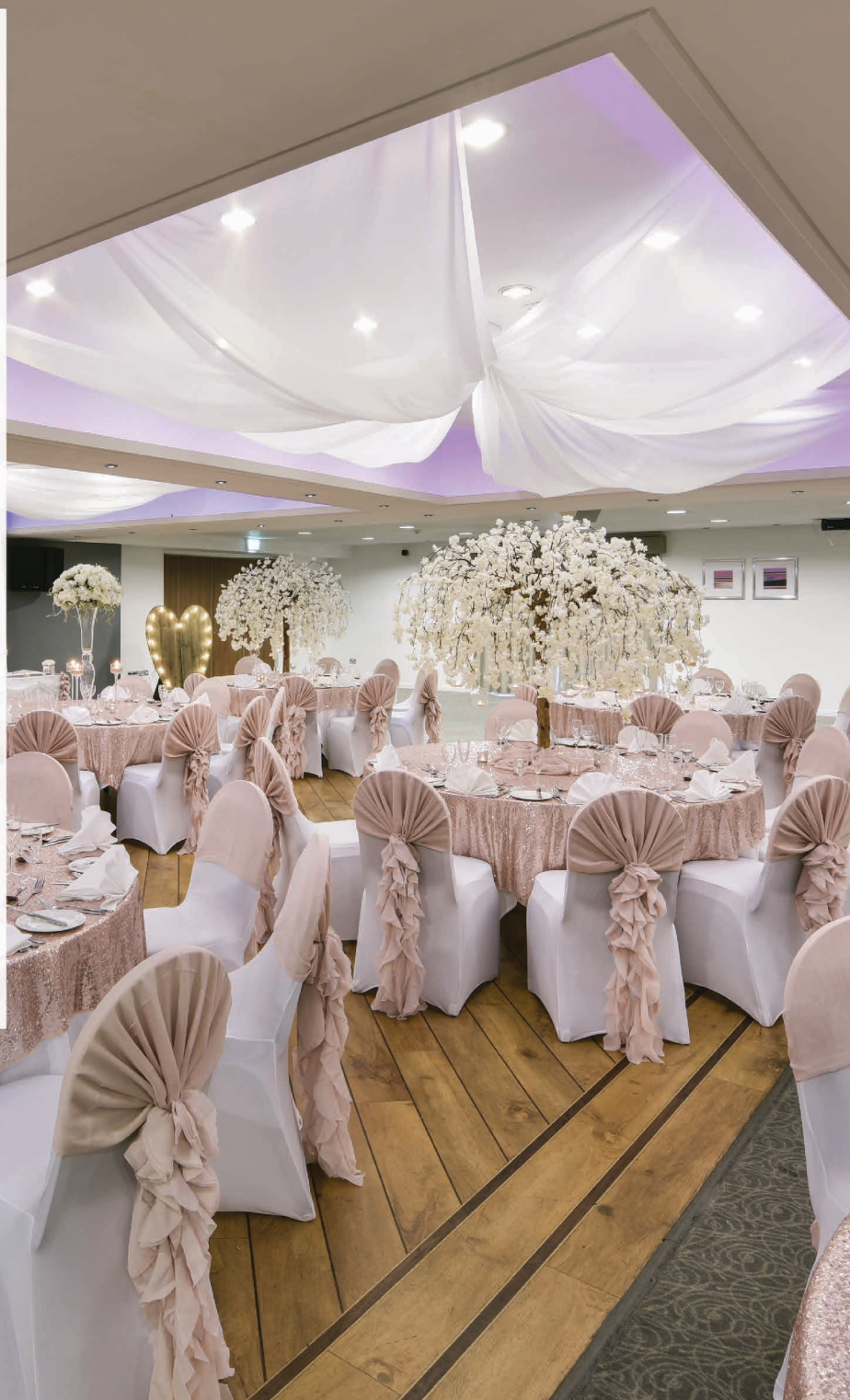
Table centre pieces