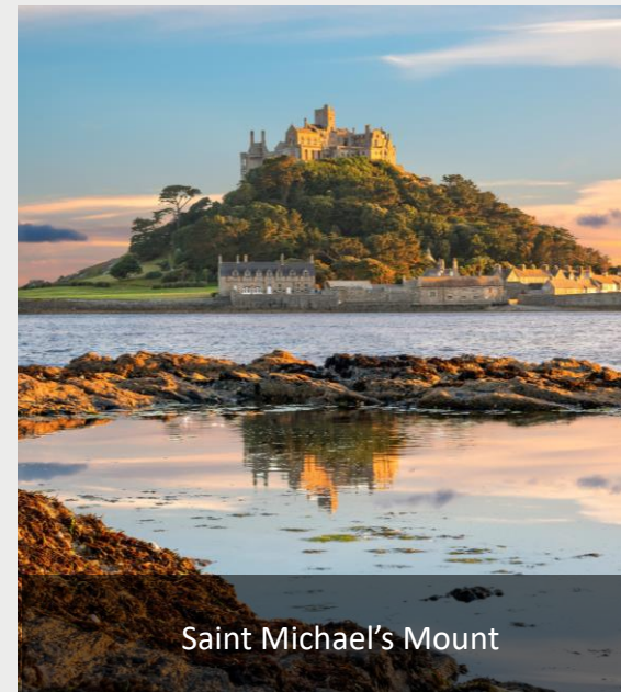
Saint Michael's Mount