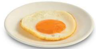
Fried Egg ไข่ดาว 20 Baht