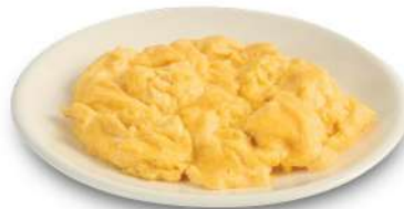
Scrambled Egg ไข่คน 35 Baht