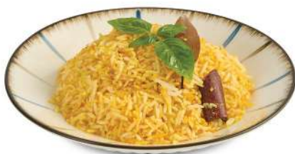
Saffron Rice ข้าวหอมกเซฟฟร่อน A Fragrant Basmati Rice with Saffron 99 Baht