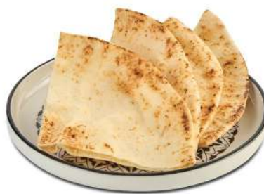
Pita Bread ขนมปังพิตา Soft and Fluffy Pita Bread. 99 Baht

Please inform your server of any allergies, food intolerance, dietary restrictions that you or any of your party may have. All prices include government tax and service charge