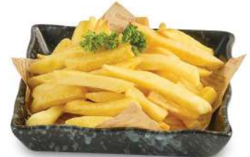
French Fries เฟรนช์ฟรายส์ 120 Baht