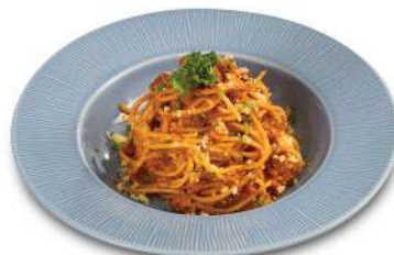
Spaghetti Bolognese สปาเก็ตตี้ซอสเนื้อ

Slow-Cooked Minced Beef, Tomatoes, Italian Herbs and Grated Parmesan Cheese.