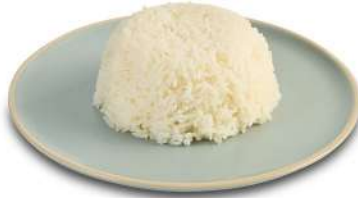
Steamed Jasmine Rice ข้าวสวย 25 Baht