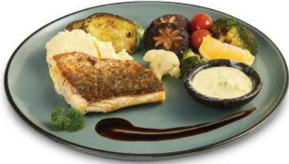
Pan-Fried Seabass ★ with Mashed Potato สเต็กปลากระพง

Pan-Fried Sea Bass served with Mash Potato, Seasonal Vegetables and Capper Butter Sauce.