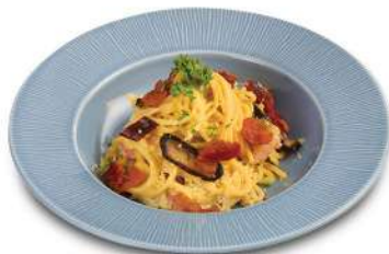
Spaghetti Alfredo สปาเก็ตตี้อัลเฟรโด

Spaghetti tossed in a Rich and Creamy Alfredo Sauce.