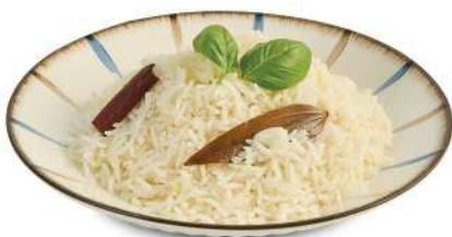
Basmati Rice ข้าวบาสมาติ Steamed Basmati Rice 59 Baht