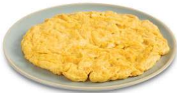
Thai Omelette ไข่เจียว 35 Baht