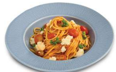
Spaghetti Al Pomodoro ★ สปาเก็ตตี้โปมโโดโรซอส

Classic Italian Spaghetti tossed in a Rich Tomato Sauce and Fragrant Basil.