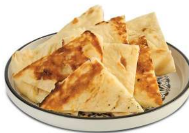
Naan Bread ขนมปังนาน Fluffy & Chewy Naan Bread *Choice of plain, garlic or butter. 59 Baht