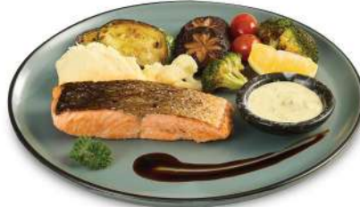
Grilled Salmon Steak ★ with Capper Butter Sauce สเต็กปลาแซลมอนชอยนเนยเคปเปอร์

Grilled Salmon Steak served with Mash Potato, Seasonal Vegetables and Capper Butter Sauce.