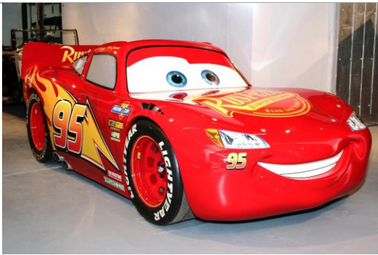
Lightning McQueen at the Canadian Auto Museum

The Canadian Automotive Museum is an automobile museum is a seven minute walk from the hotel. The museum features many Canadian-made cars as the automobile industry, specifically General Motors Canada, which has always been at the forefront of Oshawa's economy. Kids will love Pixar's Lightning McQueen which is on display in the main gallery. Address: 99 Simcoe Street South. Phone: (905) 576-1222