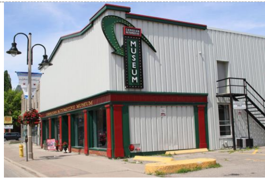
Canadian Auto Museum Exterior