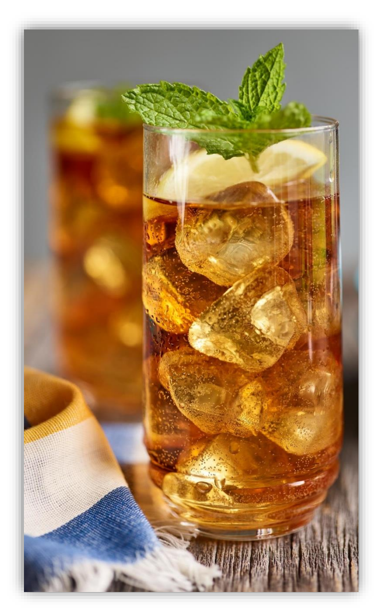
A twenty-one percent service charge and applicable state sales tax will be added to all food and beverage arrangements.

MINIMUM OF 10 PEOPLE PER PACKAGE INCLUDES ROOM RENTAL