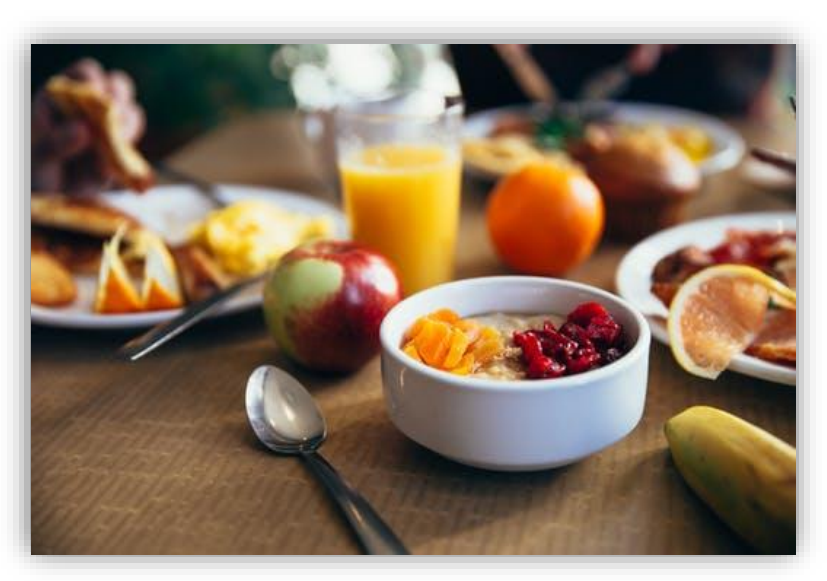
A twenty-one percent service charge and applicable state sales tax will be added to all food and beverage arrangements.

Chef's Selection of Dessert Lemonade or Iced Tea