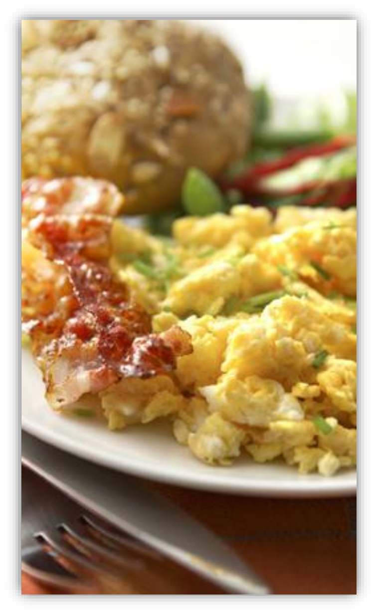
A twenty-one percent service charge and applicable state sales tax will be added to all food and beverage arrangements.