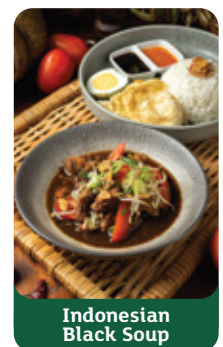
Indonesian Black Soup

All prices are in thousands rupiah and inclusive of 21% government tax and service charge