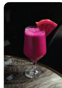
Dragon Fruit Juice