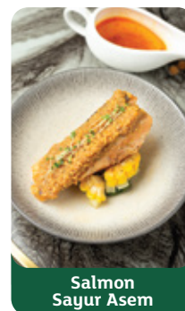
Salmon Sayur Asem