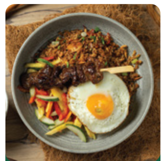
Nasi Goreng Kampung

All prices are in thousands rupiah and inclusive of 21% government tax and service charge