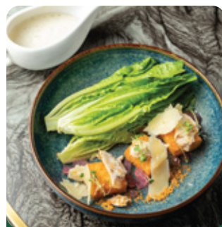
Classic Caesar Salad