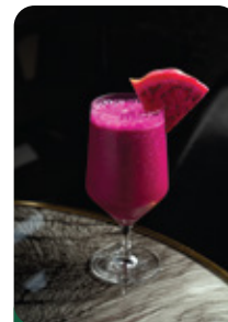
Dragon Fruit Juice