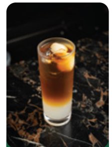
Ice Lychee Tea

All prices are in thousands rupiah and inclusive of 21% government tax and service charge