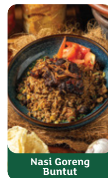
Nasi Goreng Buntut