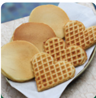
Pancake & Waffle

Choice Of Plain, Strawberry Or Low Fat Yoghurt.