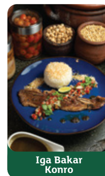
Iga Bakar Konro