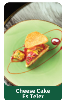
Cheese Cake Es Teler

All prices are in thousands rupiah and inclusive of 21% government tax and service charge