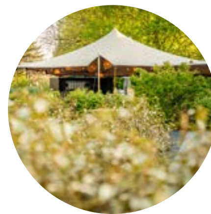
▶ POP UP SUMMER 2023