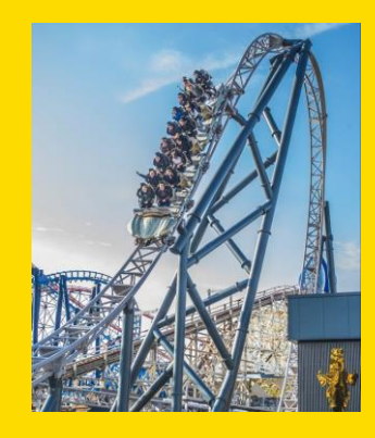
Blackpool Pleasure Beach