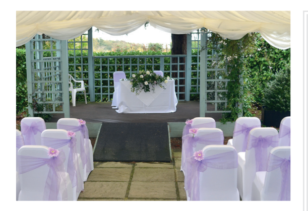
WE PROMISE TO PROVIDE MEMORIES THAT WILL LAST A LIFETIME