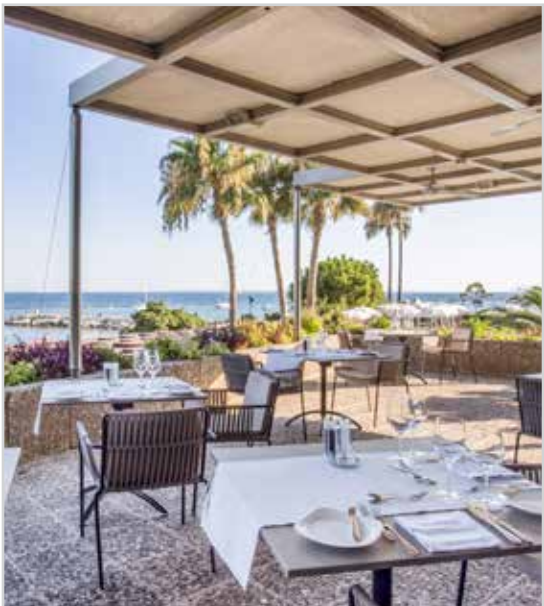
La Brezza Italian Restaurant