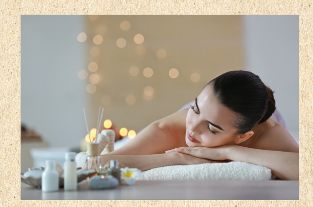
Taxes As Applicable | T&C Apply