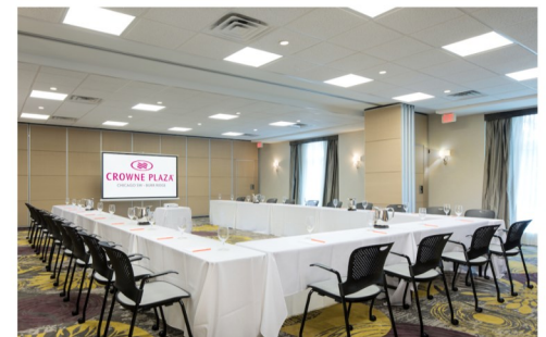
ARIA 2 & 3