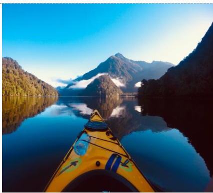
Deep Cove Kayak