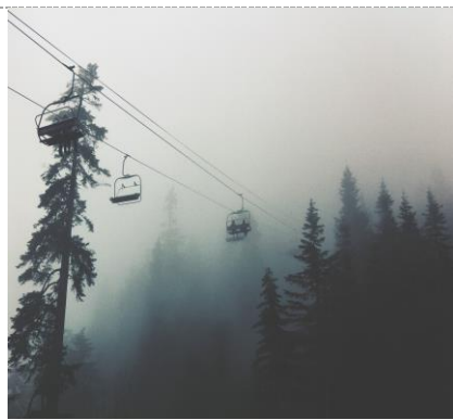
Grouse Mountain Gondola Ride