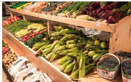
Algoma's Mill Market