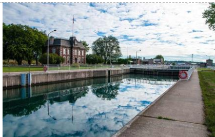
Historic Sault Locks

Start the day with a walk, The Soo Boardwalk is the legendary gateway to all your waterfront fun activities. Stop and refresh with a cold drink and bite to eat at Fluid Patio and Grill on its beautiful riverfront patio and finish the day by getting an iconic selfie at Clerge Park & Art Gallery of Algoma!