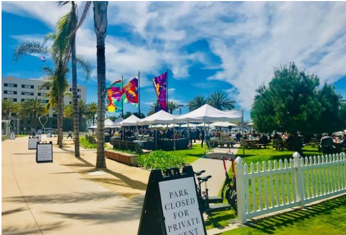
Lane Field Park