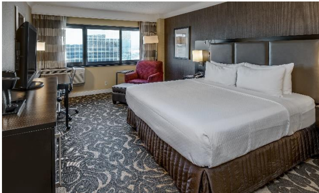
Click or tap here to enter text.