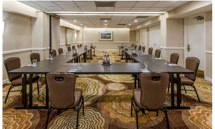
Click or tap here to enter text.