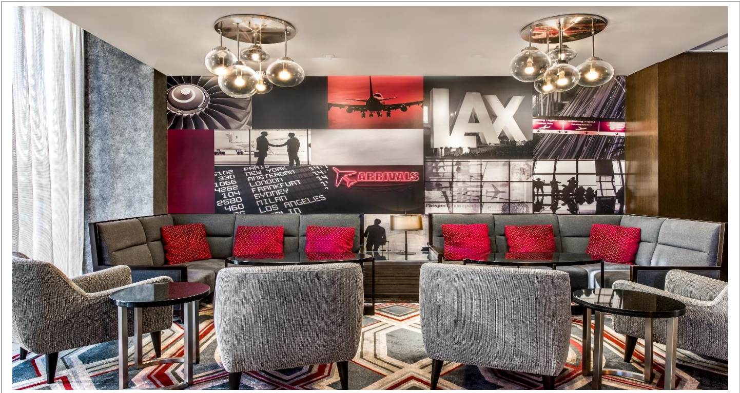
Click or tap here to enter text.