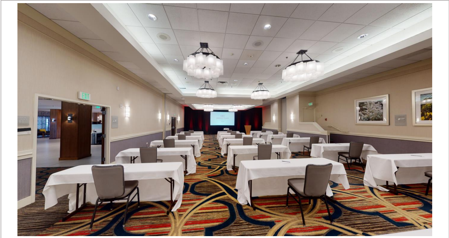
Torrey's and Oxford